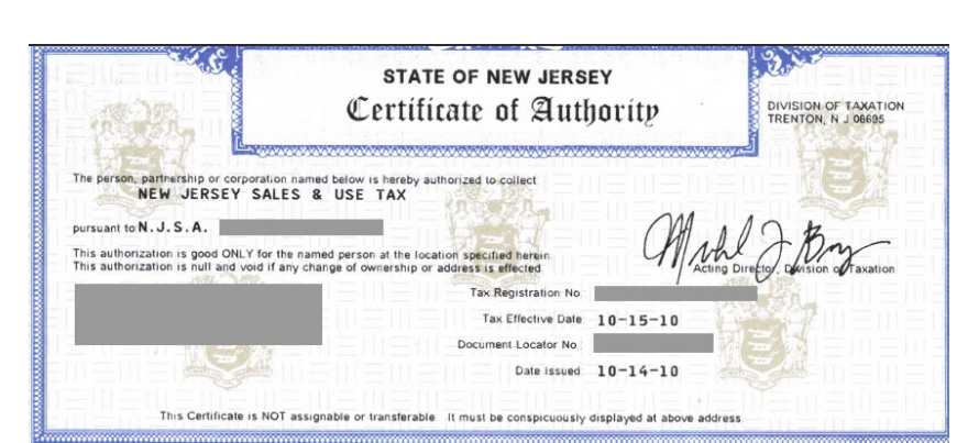
Sample Certificate of Authority

All bidders are to submit their Sworn Contractor Certification, a current valid "Certificate of Authority" as issued by the New Jersey Department of Treasury. Reference—N.J.S.A. 18A:7G-37.