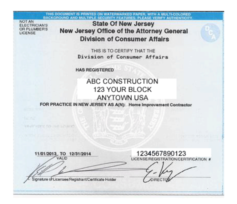
Sample Contractor Trade License

All bidders are to submit with their proposal all current, valid contractor or trade licenses as issued by the New Jersey Division of Consumer Affairs, for any trade or specialty area the contractor seeks to perform work for this particular proposal.